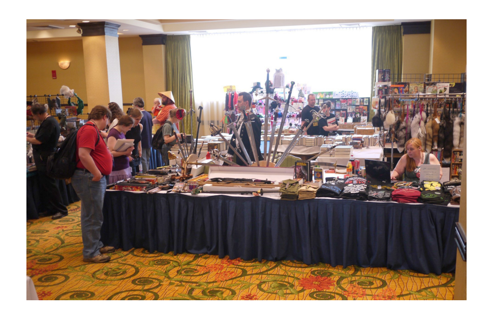
(Above): Dealer room. (Below) Star Wars storm troopers in the lobby of the Marriot.