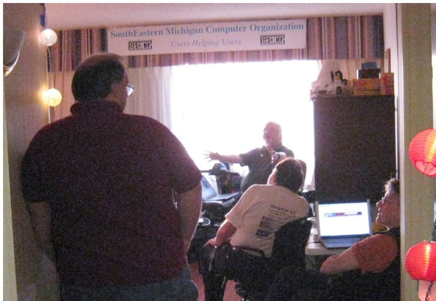
(Above): Penguicon: The MDLUG hospitality suite with SEMCO banner. (Below): The computer Lounge.